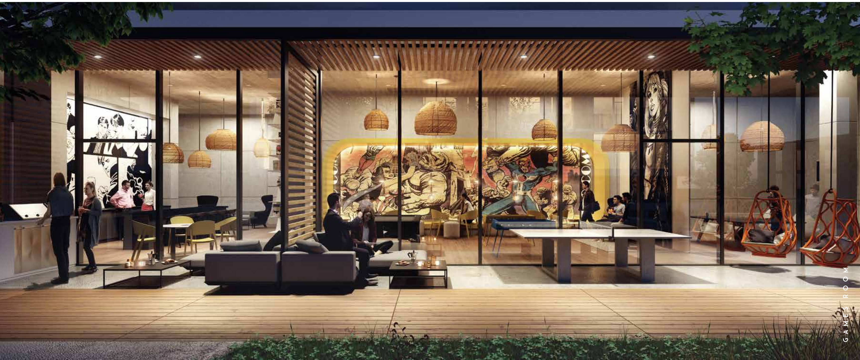
Vibrant works of art decorate amenity spaces dedicated to your amusement and entertainment. The games room features billiards and Ping-Pong, connecting to the barbecue area where swinging seats add a playful touch to the elegant outdoor space.