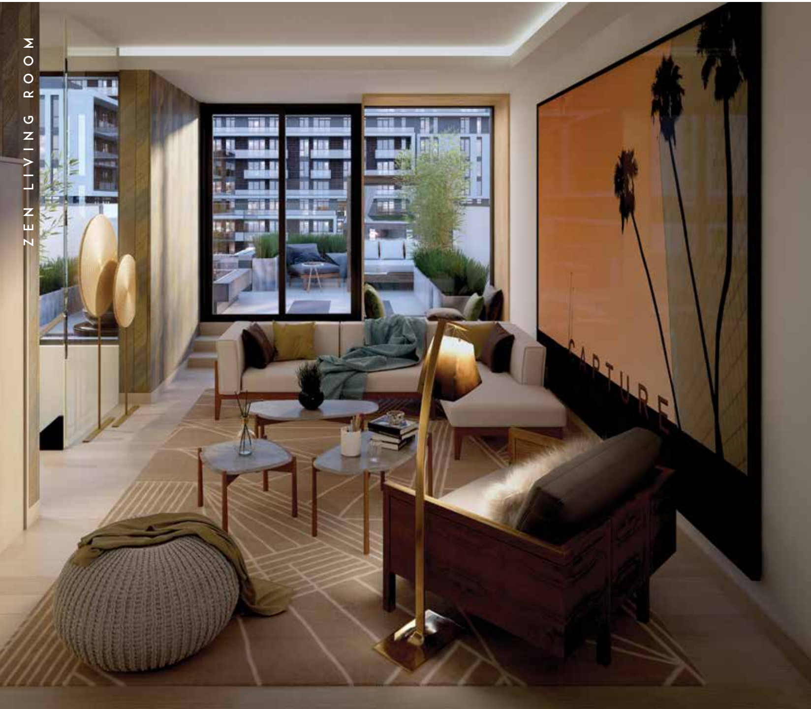
Natural light spills in through windows on each storey, presenting residents with marvelous vistas that add depth to each space. Bringing tranquility to the forefront, every element is carefully placed to complete the balance of your home.