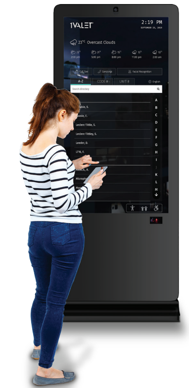
SMART ENTRY SYSTEM