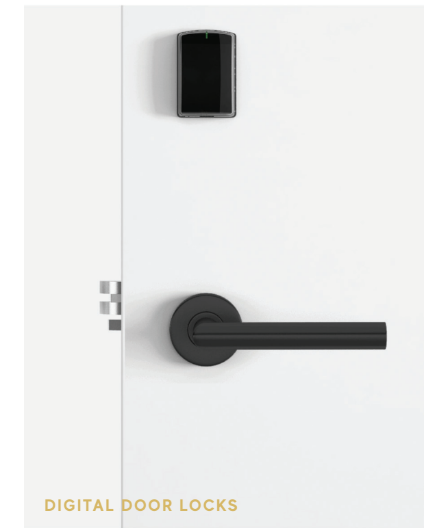
DIGITAL DOOR LOCKS