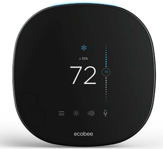
SMART THERMOSTAT WITH BUILT IN ALEXA