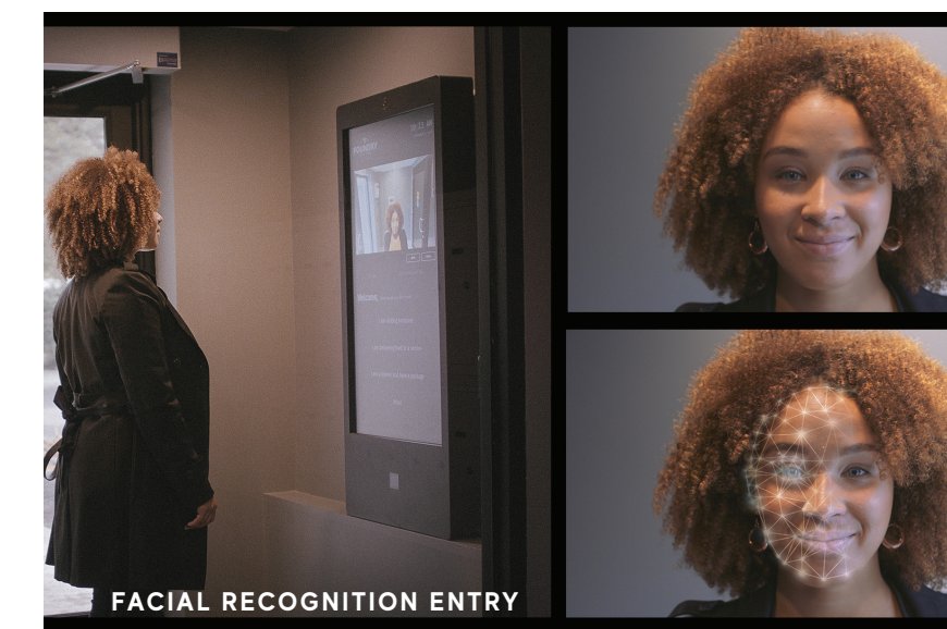
FACIAL RECOGNITION ENTRY