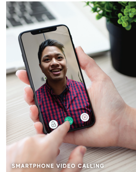
SMARTPHONE VIDEO CALLING