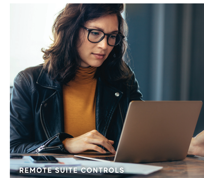
REMOTE SUITE CONTROLS