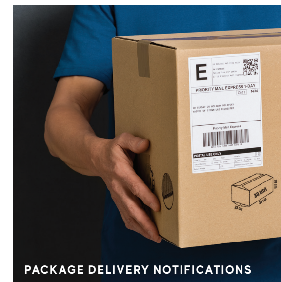
PACKAGE DELIVERY NOTIFICATIONS