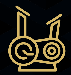
GYM WITH PELOTON® BIKES