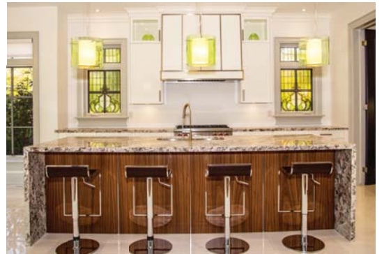
CUSTOM HOME (OAKVILLE)