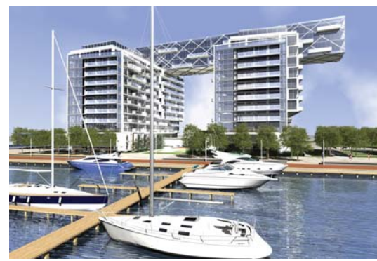
PIER 27 (DOWNTOWN TORONTO)

Grand River Woods (Cambridge), Harvest Hills (East Gwillimbury), Paris Riverside (Paris), Rocking Horse and Parkside (Milton), Upper Glen Abbey and Edgewater (Oakville), Valleyview and Shady Glen (Stoney Creek), Wildflowers and Cobblestone (Hamilton).