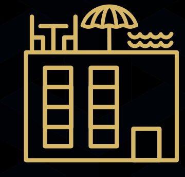
ROOFTOP LOUNGE & POOL/SPA