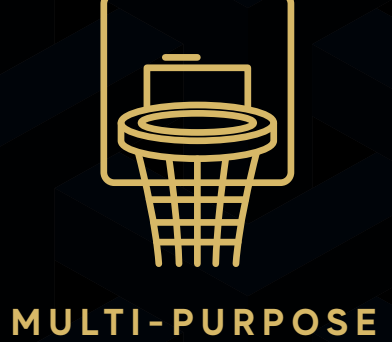
MULTI-PURPOSE ACTIVITY COURT