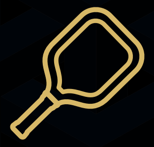
PICKLE BALL COURT