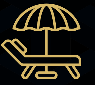
LEISURE SITTING AREAS