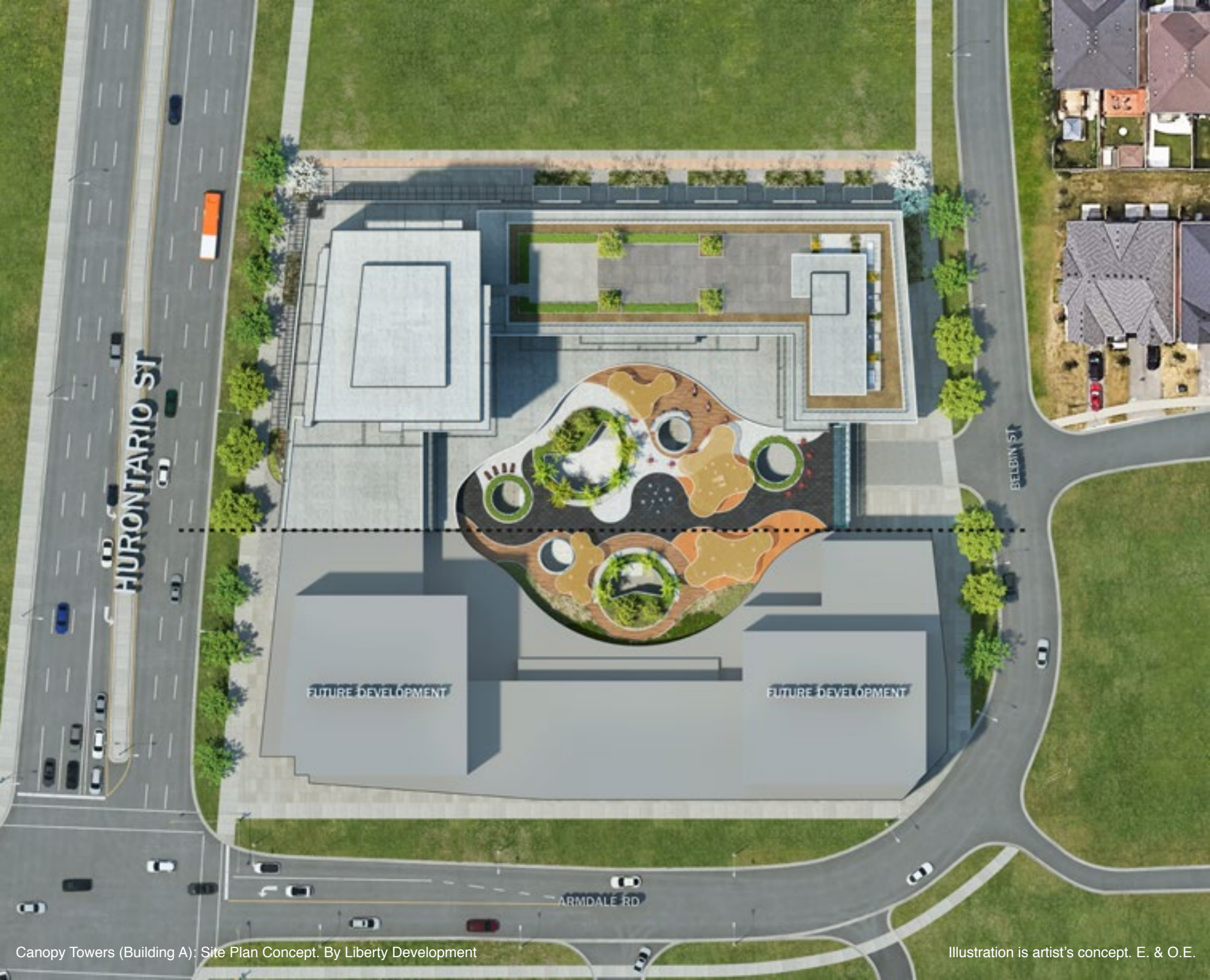
Canopy Towers (Building A): Site Plan Concept. By Liberty Development