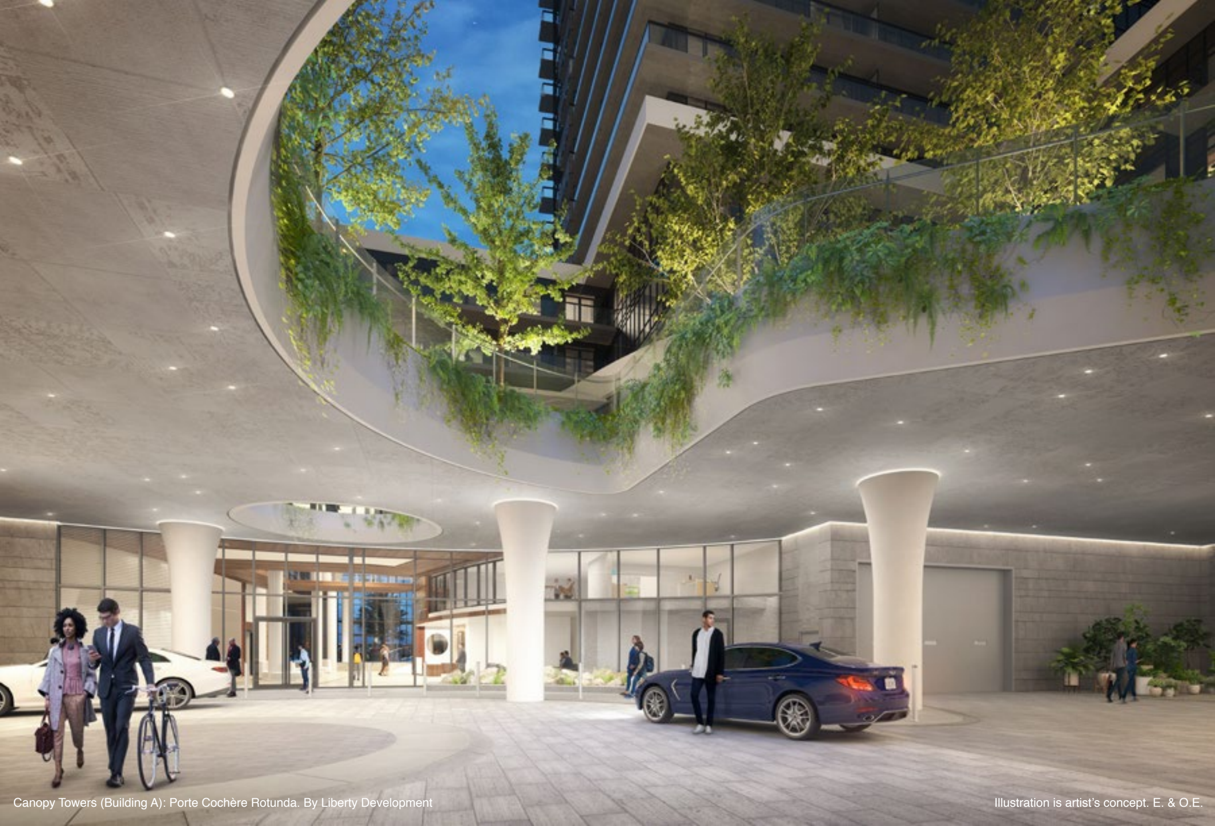
Canopy Towers (Building A): Porte Cochère Rotunda. By Liberty Development