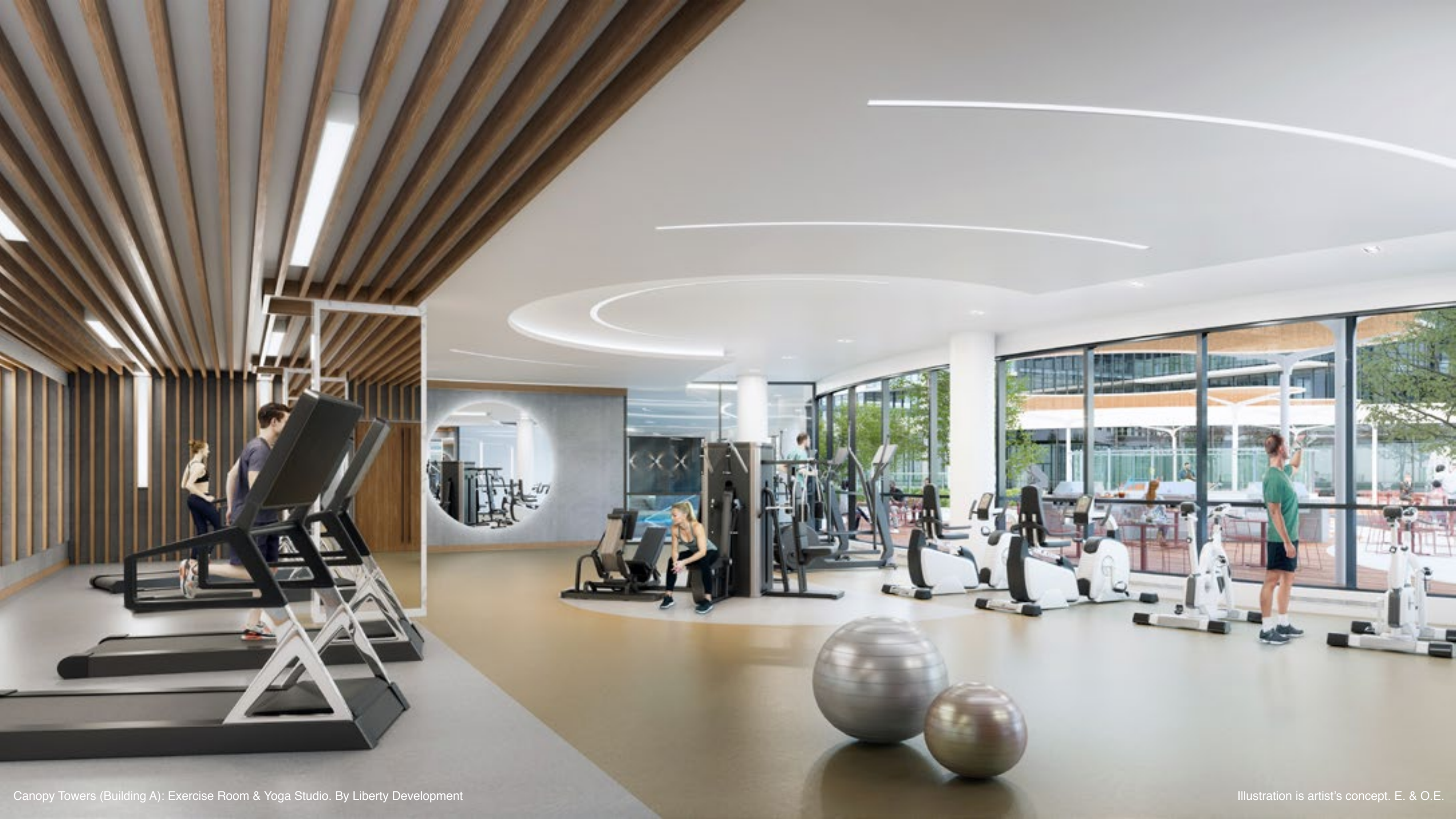
Canopy Towers (Building A): Exercise Room & Yoga Studio. By Liberty Development