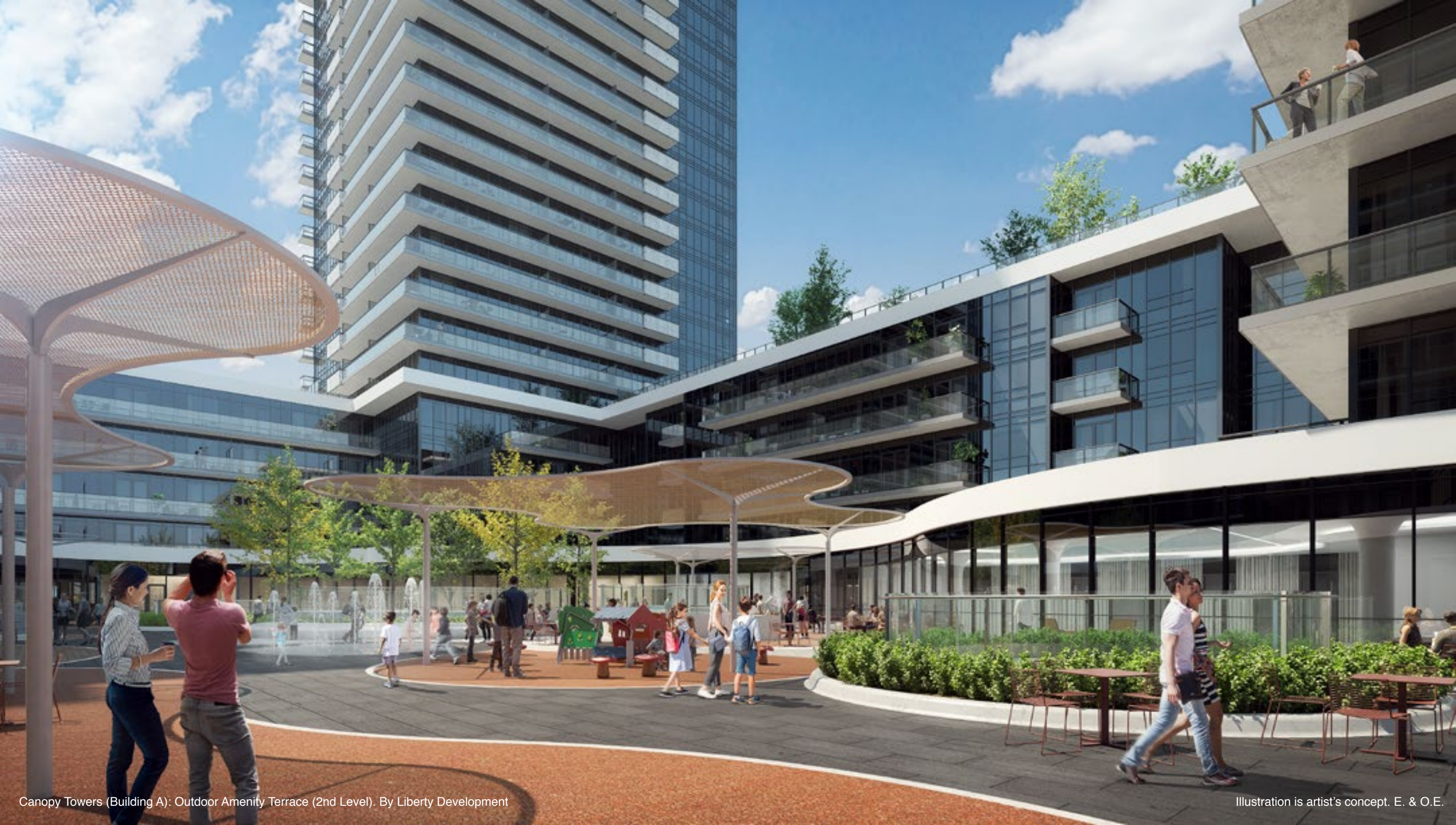
Canopy Towers (Building A): Outdoor Amenity Terrace (2nd Level). By Liberty Development

Illustration is artist's concept. E. & O.E.