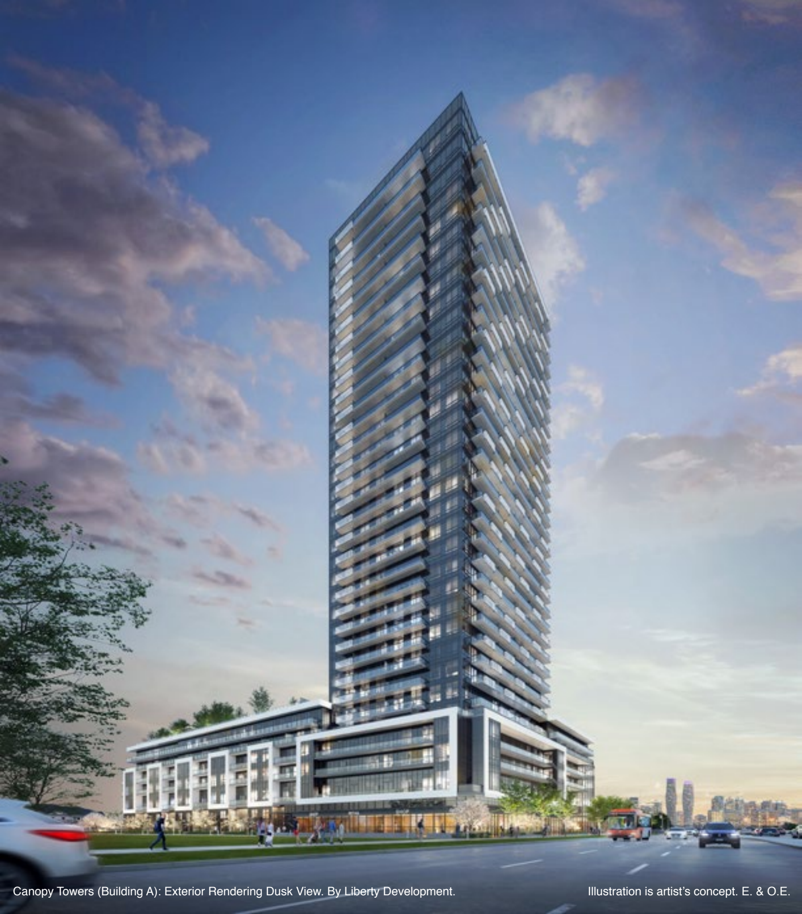
Canopy Towers (Building A): Exterior Rendering Dusk View. By Liberty Development.

Illustration is artist's concept. E. & O.E.