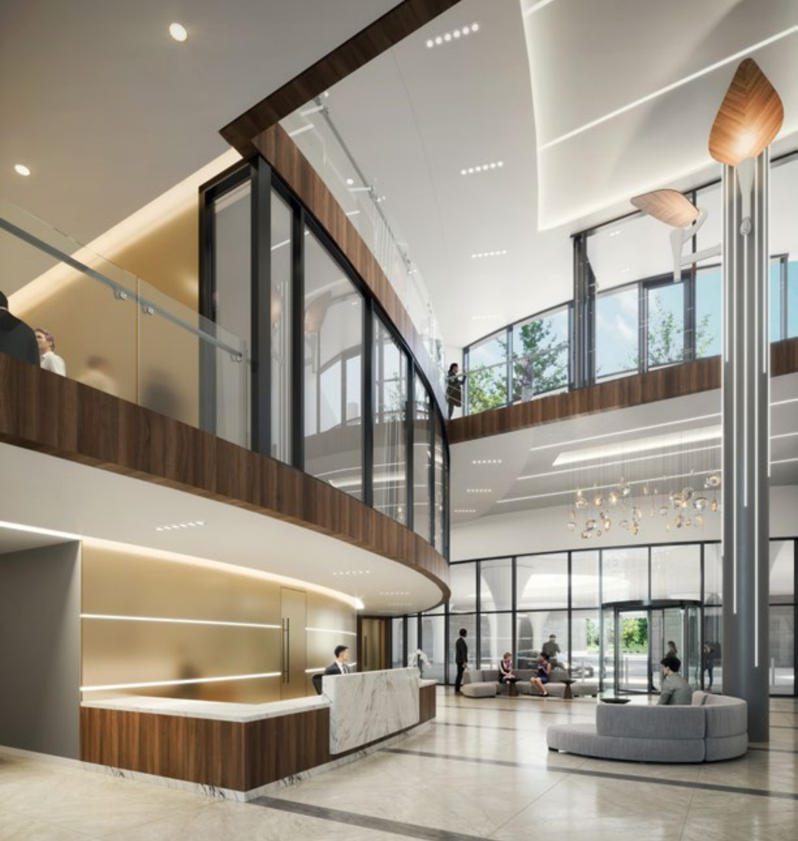
Canopy Towers (Building A): Lobby Rendering. By Liberty Development

Illustration is artist's concept. E. & O.E.