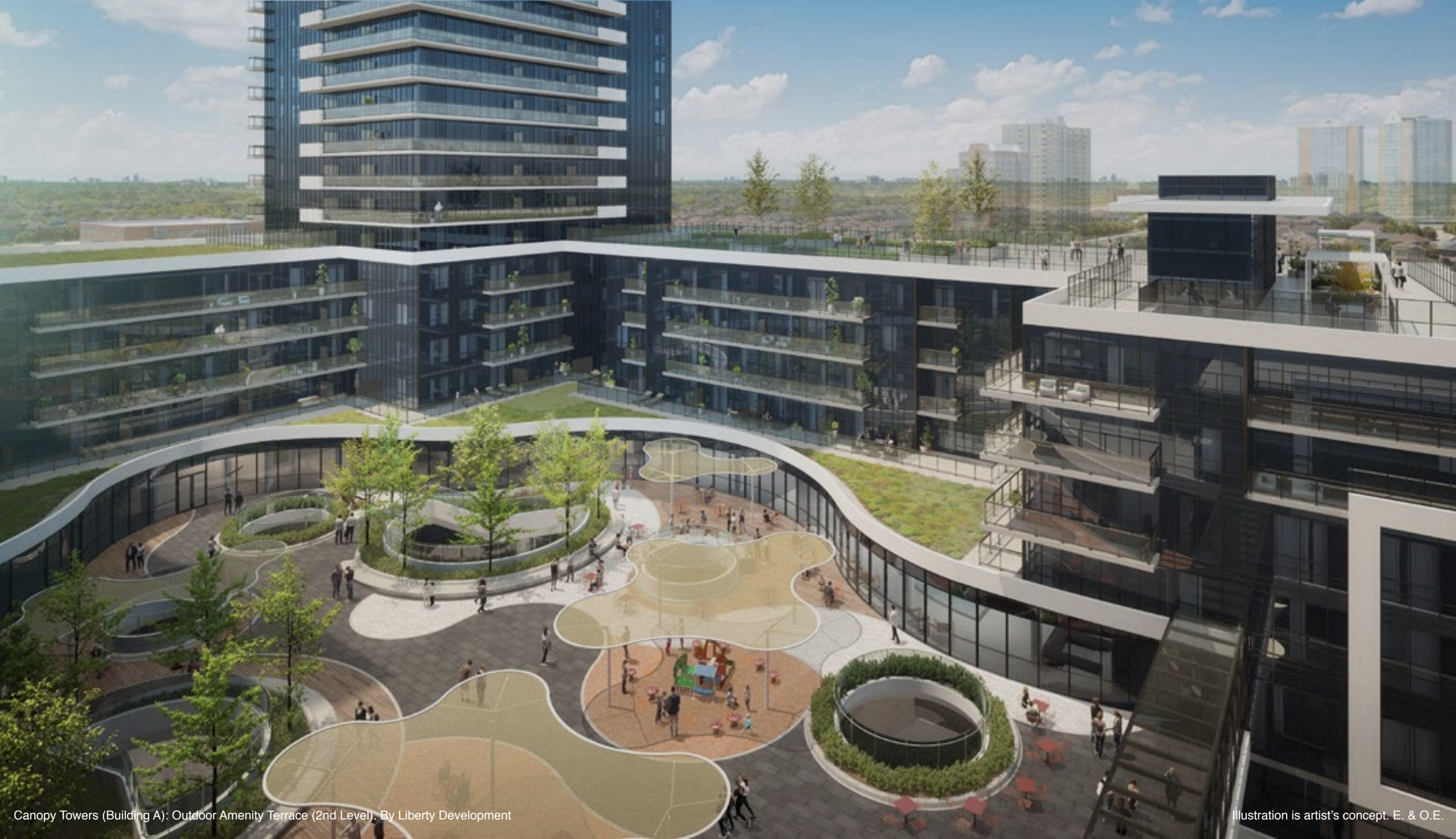
Canopy Towers (Building A): Outdoor Amenity Terrace (2nd Level). By Liberty Development

Illustration is artist's concept. E. & O.E.