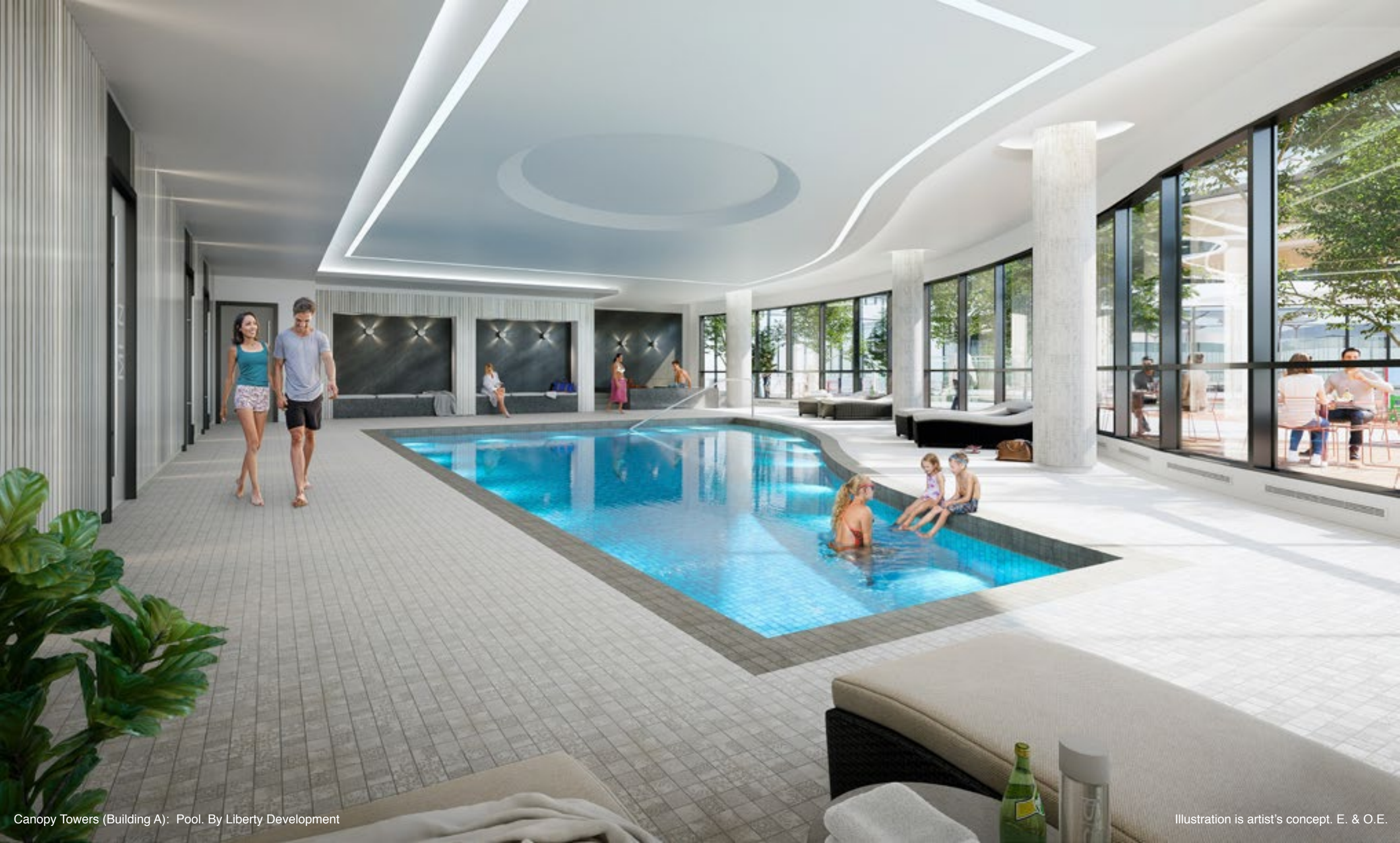
Canopy Towers (Building A): Pool. By Liberty Development